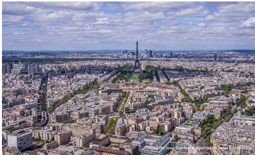
Eiffel Tower from Tour Montparnasse

Ryan: Everyone raves about the view from the Eiffel Tower, but there is one thing missing from any photo taken from the top... the Eiffel Tower! If you want to see the city in all its glory, go instead to Tour Montparnasse located in the district of Montparnasse in the south of the city. Tickets cost €15 per person and the queue to go up is always a fraction of what you experience at the more famous Tour Eiffel.