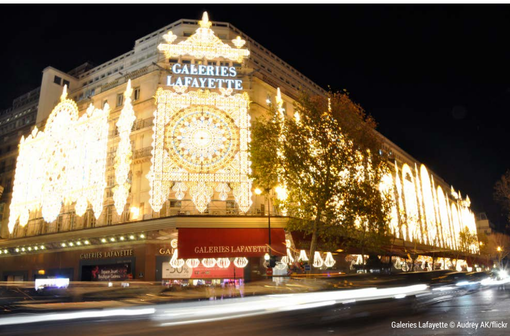
Galleries Lafayette

Salted Caramel and Milk Chocolate with Passion Fruit. Be prepared to elbow your way past the constant stream of Japanese tourists who seem to devour these treats by the boxload. Shops are located throughout the city. If you are visiting the Louvre, the shop at 4 rue Cambon is convenient.